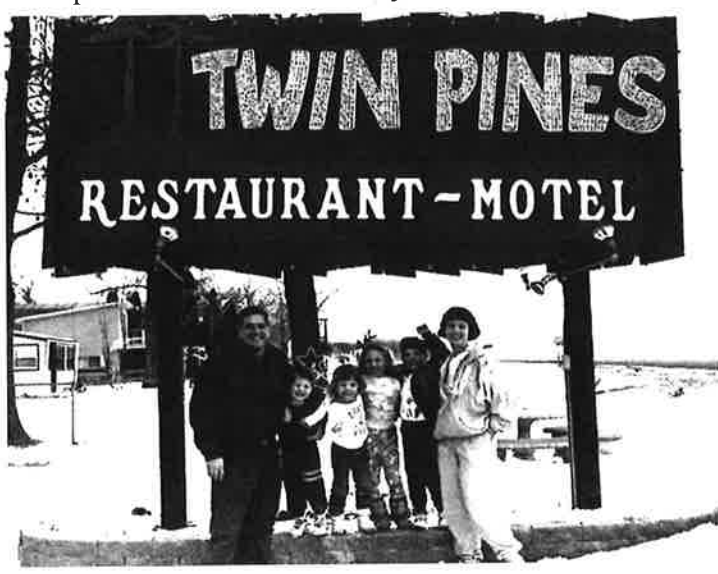
Living The Dream

a business on to your children under these circumstances. The political management has caused the collapse of the lake's economy!