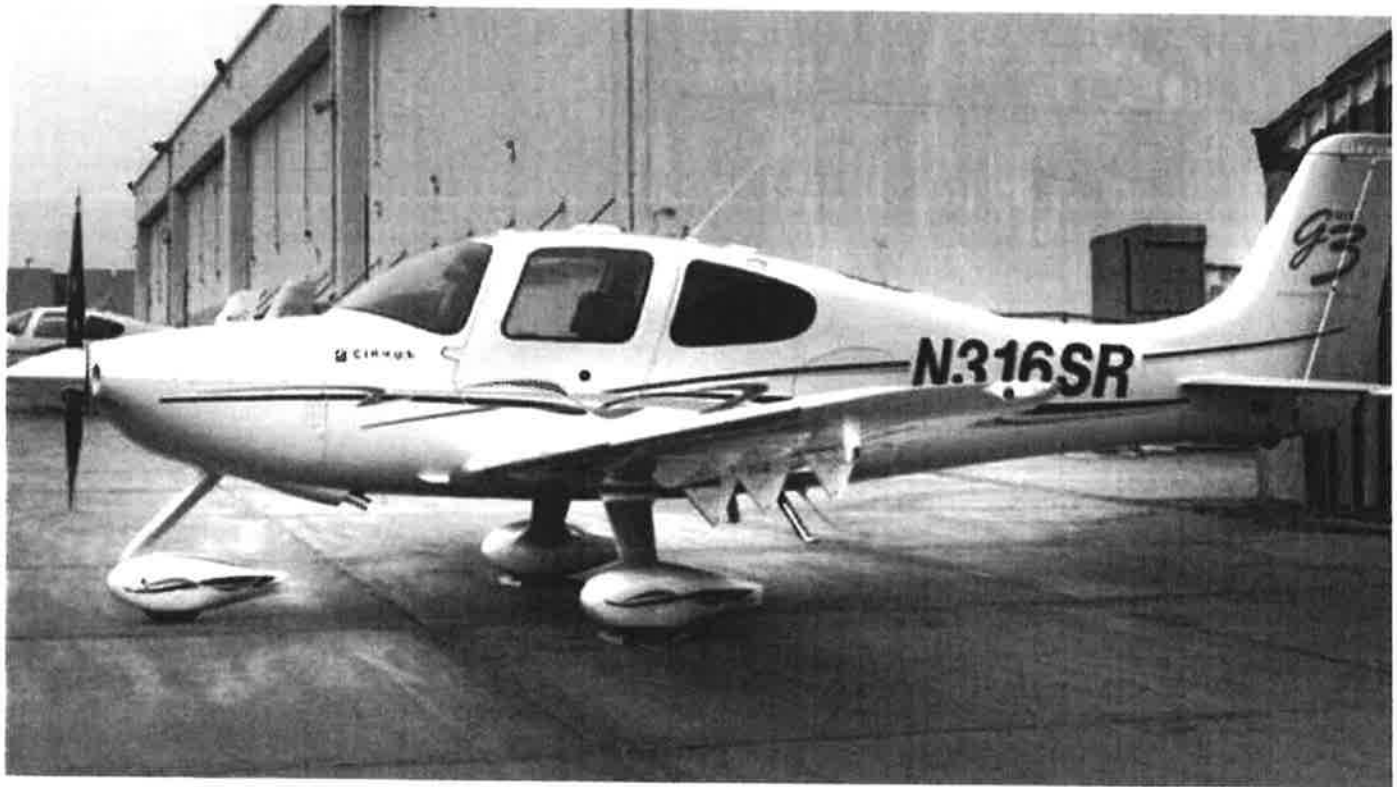
Midwest Aircraft Refinishers was awarded a $600,000 loan Thursday by Iron Range Resources and Rehabilitation Board to expand their business of refurbishing Cirrus aircraft, which are built in Duluth.