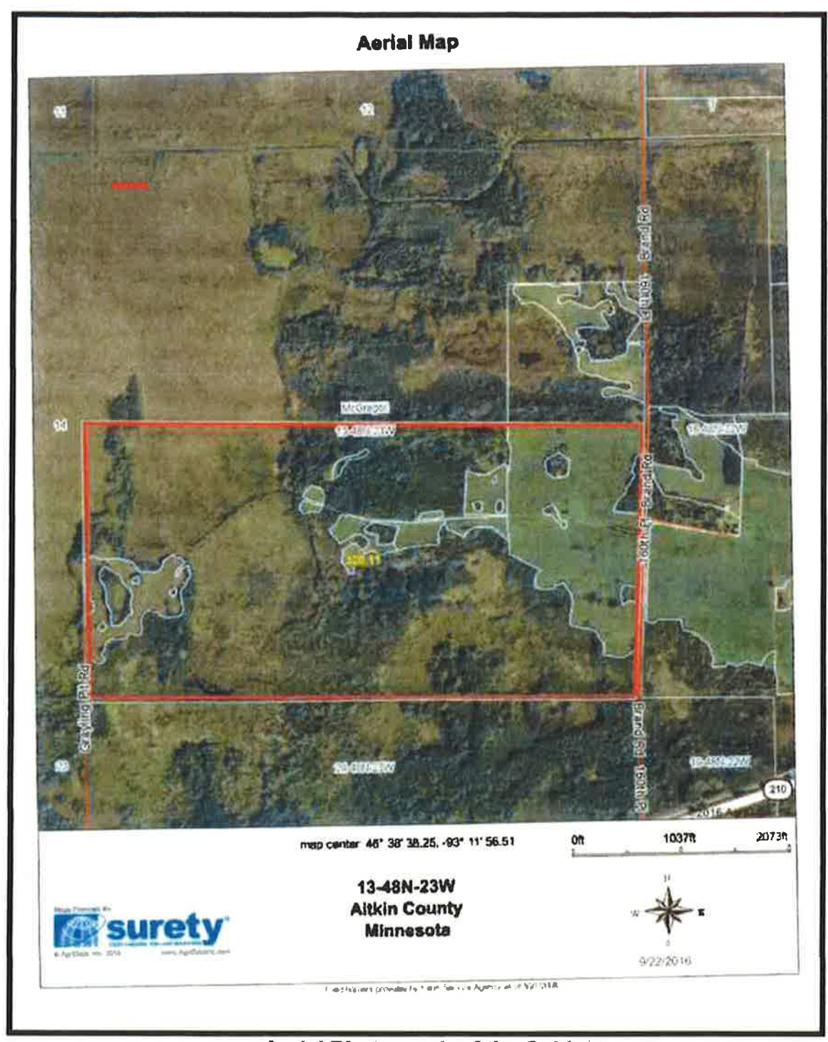
Aerial Photograph of the Subject