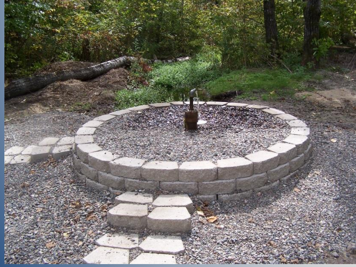
Artesian well located at the park.