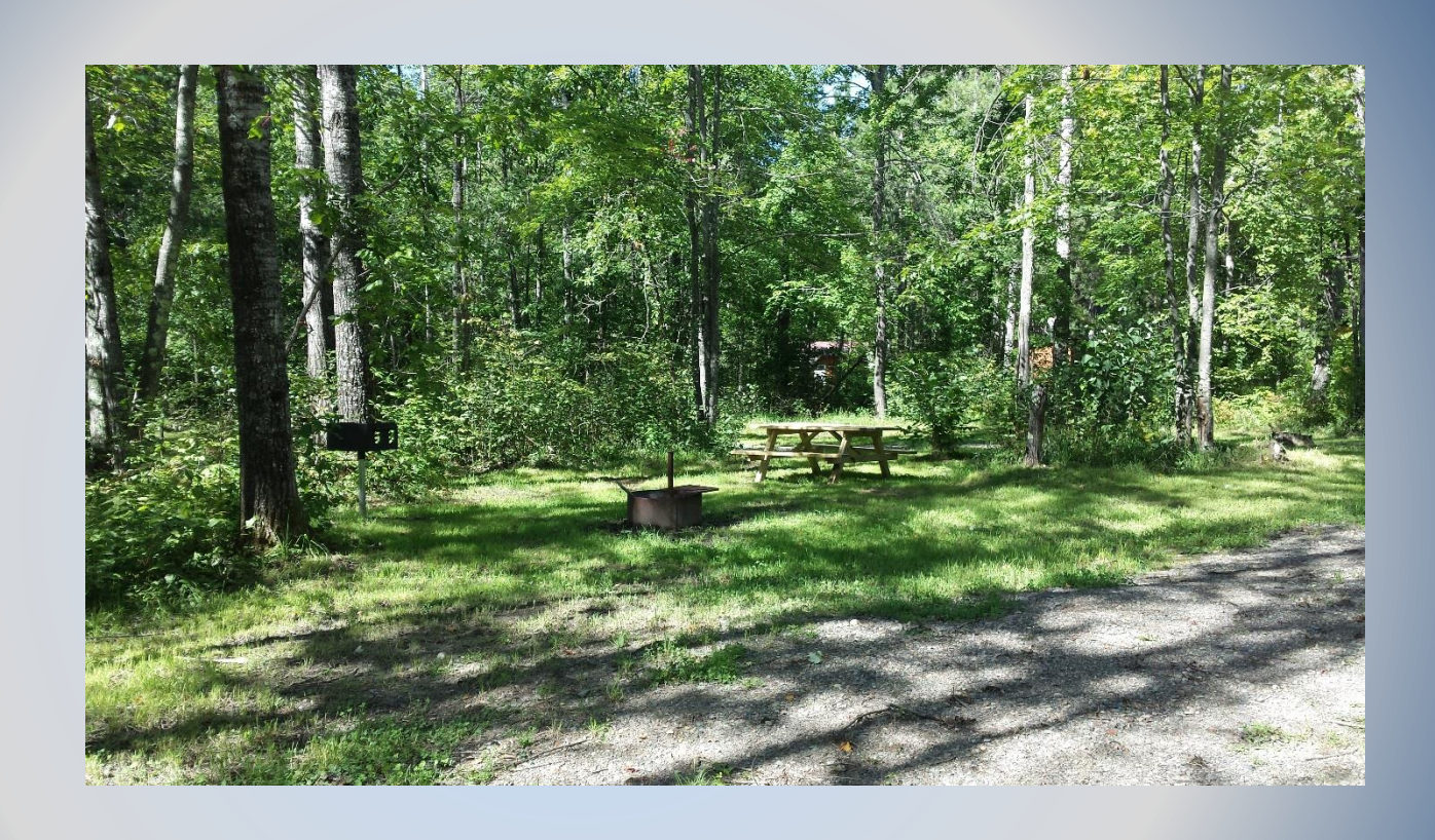
Site 11 – RV drive thru site. Picnic table, grill and fire pit.